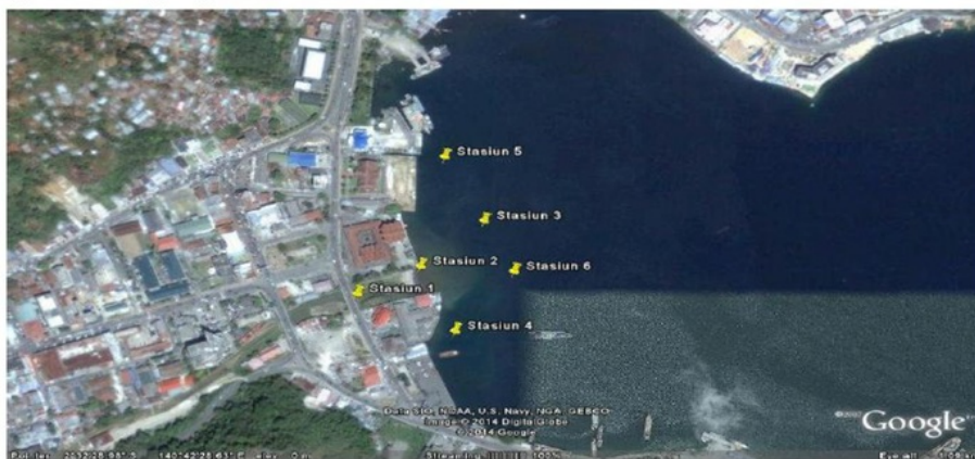
Figure 1 : Sampling Location

Sampling Location: samples were collected at the Gulf of Yos Sudarso region, and the estuary of Anafre River, both are located in Jayapura City.